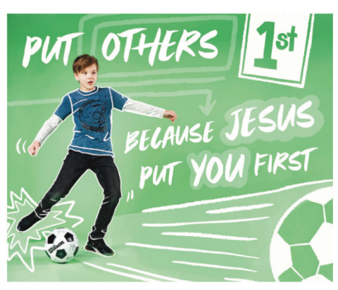
APRIL I WHAT JESUS DID FOR YOU, CHANGES EVERYTHING