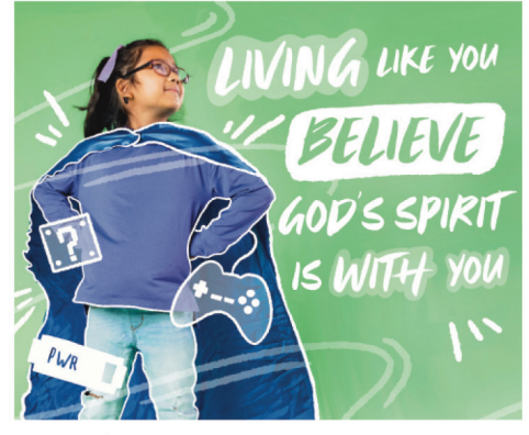
MAY I WHAT JESUS PROMISED THE DISCIPLES