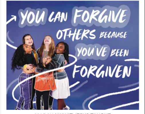
MARCH I WHAT JESUS TAUGHT US ABOUT FORGIVENESS