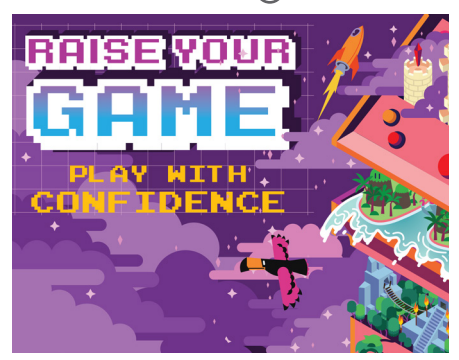
JUNE & JULY—FAITH