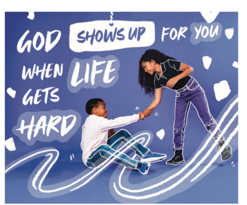
OCTOBER | WHAT JOSEPH AND MOSES LEARNED ABOUT GOD