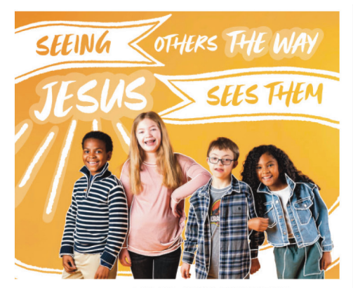
FEBRUARY I WHAT JESUS TAUGHT US ABOUT HOW TO TREAT OTHERS