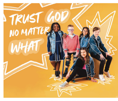
SEPTEMBER I LEARNING ABOUT THE GOD OF ABRAHAM, ISAAC, AND JACOB