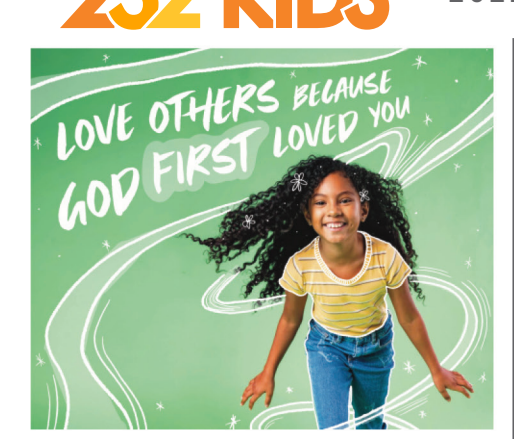
AUGUST | WHAT JESUS TAUGHT ABOUT THE GREAT COMMANDMENT