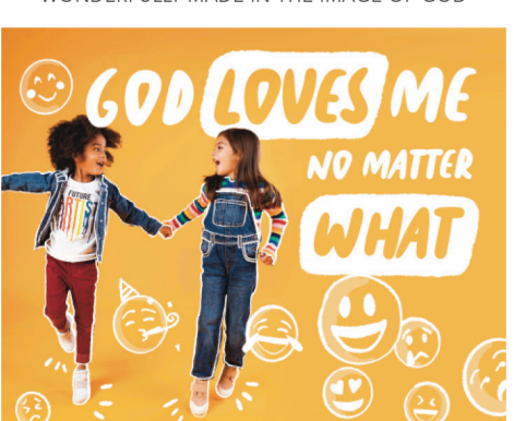
SEPTEMBER I WHEN WE READ ABOUT PEOPLE IN THE BIBLE IT REMINDS US THAT GOD LOVES US