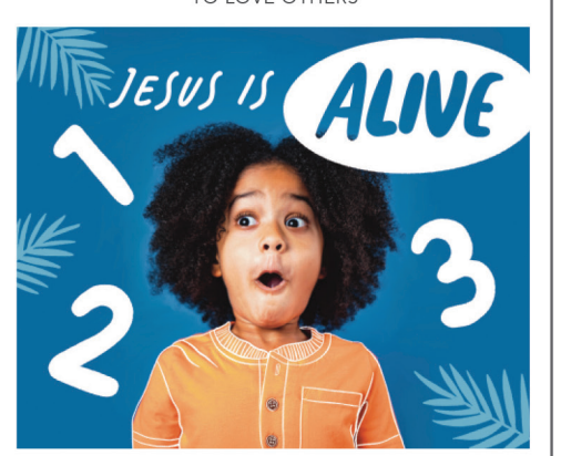
APRIL I WHAT JESUS DID, MEANS HE CAN BE YOUR FRIEND FOREVER