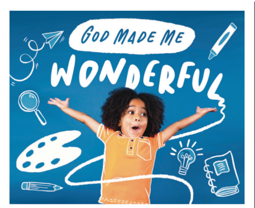
AUGUST I THE CREATION STORY SHOWS US WE ARE WONDERFULLY MADE IN THE IMAGE OF GOD