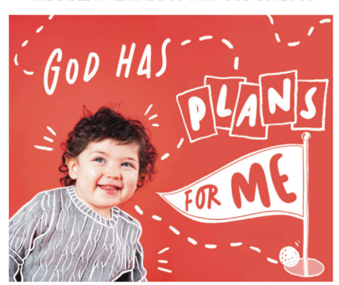
OCTOBER I NOAH AND JOSEPH SHOW US WE CAN TRUST GOD'S PLANS, EVEN WHEN IT'S HARD