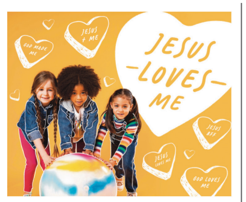
FEBRUARY I EVERYTHING JESUS DID SHOWS US HOW MUCH HE LOVES US