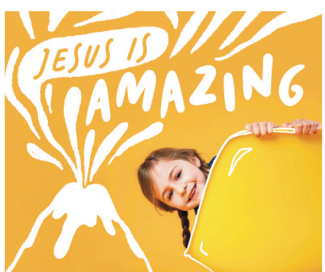
JANUARY I WE LEARN THAT JESUS SAID AND DID AMAZING THINGS