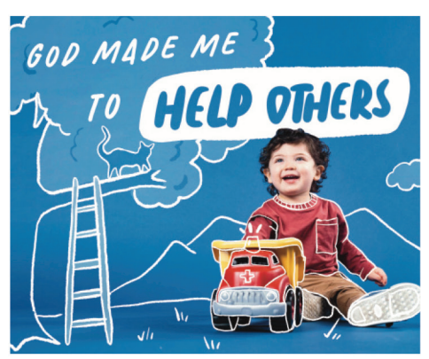
MAY | PEOPLE IN THE BIBLE SHOW US DIFFERENT WAYS GOD MADE US TO HELP