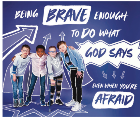
NOVEMBER | WHAT GOD REMINDED JOSHUA, DAVID, DANIEL, AND ESTHER