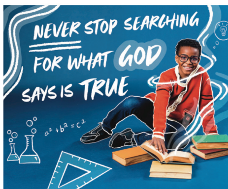
JANUARY | LESSONS FROM THE LIFE OF JESUS ABOUT SCRIPTURE