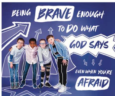
NOVEMBER | WHAT GOD REMINDED JOSHUA, DAVID, DANIEL, AND ESTHER