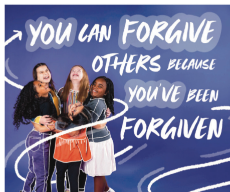
MARCH | WHAT JESUS TAUGHT US ABOUT FORGIVENESS