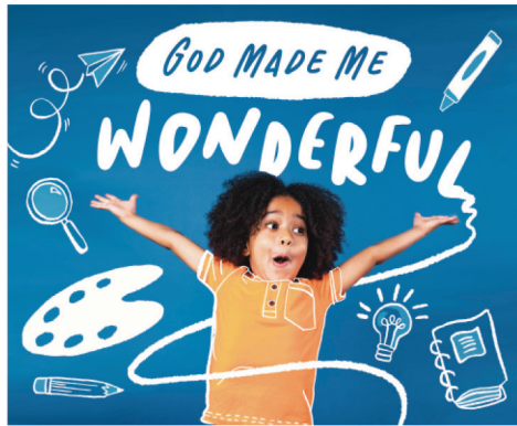
AUGUST | THE CREATION STORY SHOWS US WE ARE WONDERFULLY MADE IN THE IMAGE OF GOD