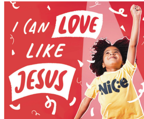
MARCH | JESUS TAUGHT US HOW TO LOVE OTHERS