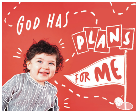
OCTOBER | NOAH AND JOSEPH SHOW US WE CAN TRUST GOD'S PLANS, EVEN WHEN IT'S HARD