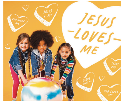
FEBRUARY | EVERYTHING JESUS DID SHOWS US HOW MUCH HE LOVES US