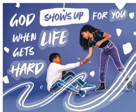
OCTOBER | WHAT JOSEPH AND MOSES LEARNED ABOUT GOD