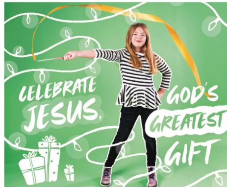
DECEMBER | WHAT THE BIRTH OF JESUS MEANS TO THE WORLD