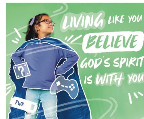
MAY | WHAT JESUS PROMISED THE DISCIPLES