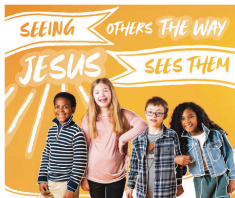
FEBRUARY | WHAT JESUS TAUGHT US ABOUT HOW TO TREAT OTHERS