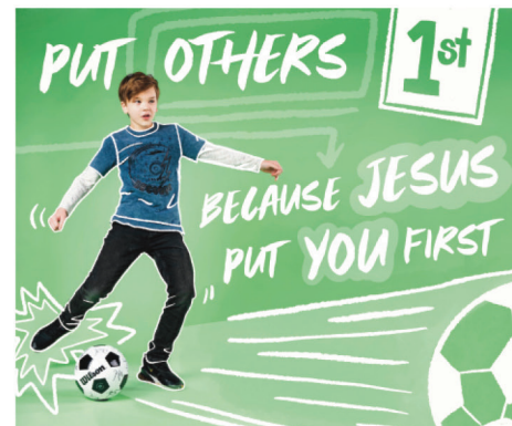
APRIL | WHAT JESUS DID FOR YOU, CHANGES EVERYTHING