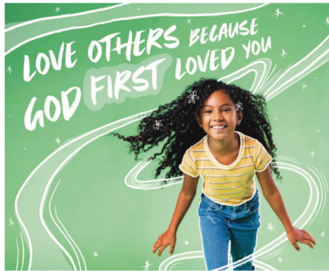
AUGUST | WHAT JESUS TAUGHT ABOUT THE GREAT COMMANDMENT