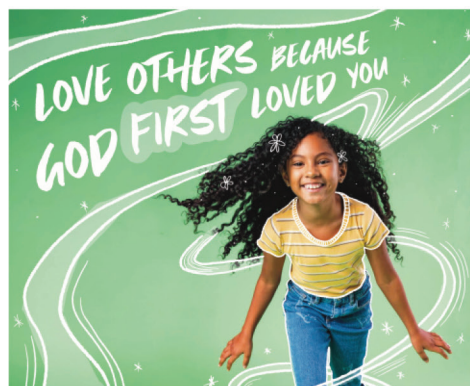
AUGUST | WHAT JESUS TAUGHT ABOUT THE GREAT COMMANDMENT