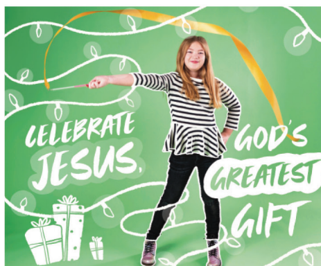
DECEMBER | WHAT THE BIRTH OF JESUS MEANS TO THE WORLD