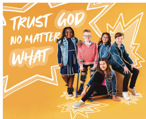
SEPTEMBER | LEARNING ABOUT THE GOD OF ABRAHAM, ISAAC, AND JACOB