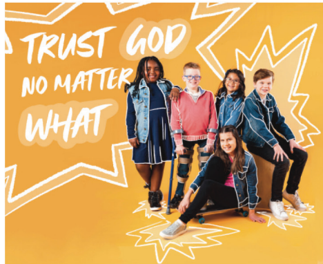
SEPTEMBER | LEARNING ABOUT THE GOD OF ABRAHAM, ISAAC, AND JACOB