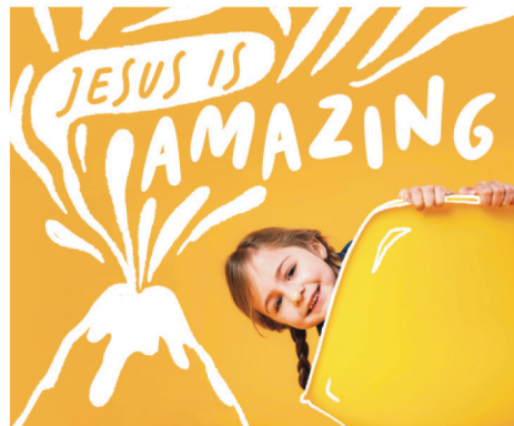
JANUARY | WE LEARN THAT JESUS SAID AND DID AMAZING THINGS