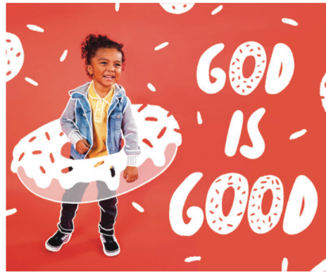
NOVEMBER | GOD SHOWS GOODNESS TO ELIJAH, MOSES, AND NEHEMIAH