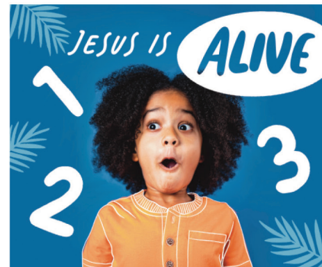
APRIL | WHAT JESUS DID, MEANS HE CAN BE YOUR FRIEND FOREVER