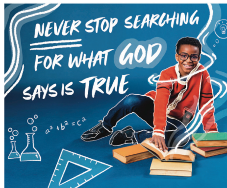
JANUARY | LESSONS FROM THE LIFE OF JESUS ABOUT SCRIPTURE