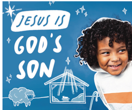
DECEMBER | JESUS, GOD'S ONLY SON, CAME TO SHOW US HOW MUCH GOD LOVES US