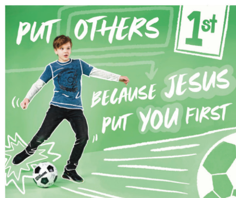
APRIL | WHAT JESUS DID FOR YOU, CHANGES EVERYTHING