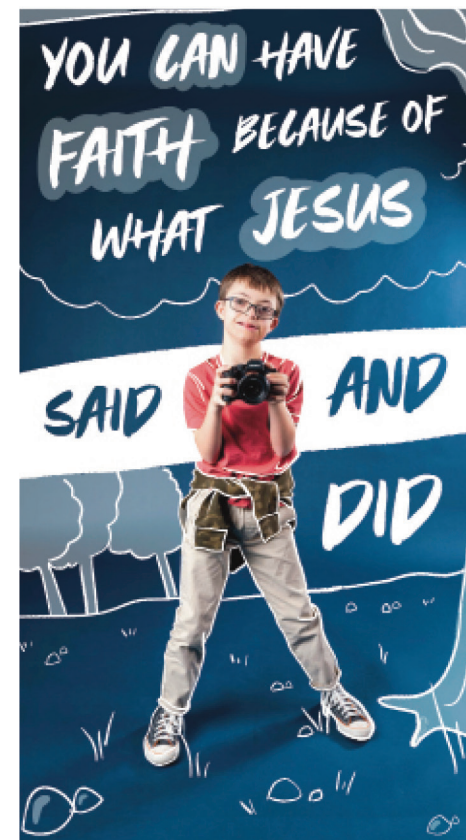
JUNE & JULY | FOLLOW THE STORY OF PETER AND PAUL