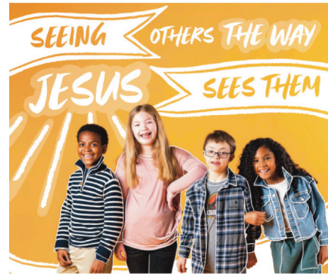
FEBRUARY | WHAT JESUS TAUGHT US ABOUT HOW TO TREAT OTHERS