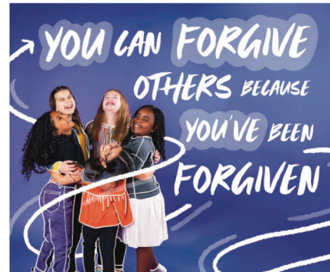
MARCH | WHAT JESUS TAUGHT US ABOUT FORGIVENESS