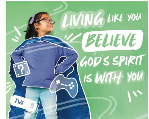
MAY | WHAT JESUS PROMISED THE DISCIPLES