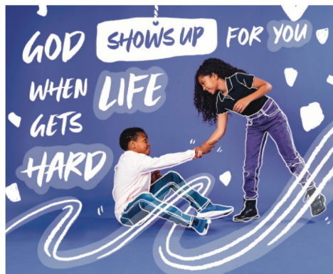
OCTOBER | WHAT JOSEPH AND MOSES LEARNED ABOUT GOD