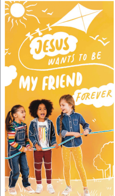
JUNE & JULY | PETER AND PAUL SHOW US HOW JESUS WANTS TO BE OUR FRIEND