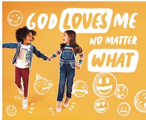
SEPTEMBER | WHEN WE READ ABOUT PEOPLE IN THE BIBLE IT REMINDS US THAT GOD LOVES US