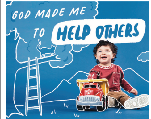
MAY | PEOPLE IN THE BIBLE SHOW US DIFFERENT WAYS GOD MADE US TO HELP