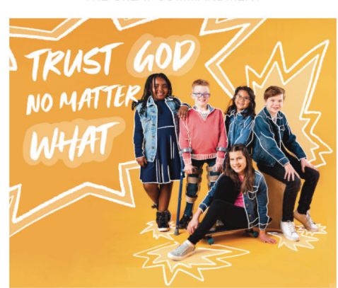
SEPTEMBER I LEARNING ABOUT THE GOD OF ABRAHAM, ISAAC, AND JACOB