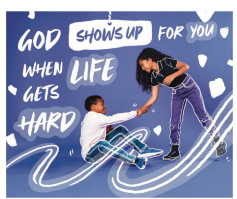
OCTOBER I WHAT JOSEPH AND MOSES LEARNED ABOUT GOD