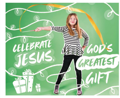
DECEMBER I WHAT THE BIRTH OF JESUS MEANS TO THE WORLD