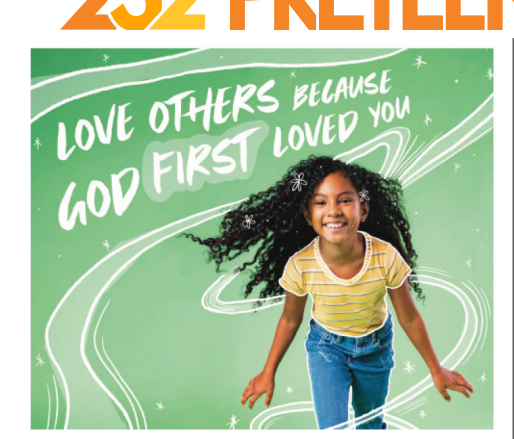
AUGUST I WHAT JESUS TAUGHT ABOUT THE GREAT COMMANDMENT