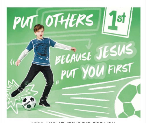
APRIL I WHAT JESUS DID FOR YOU, CHANGES EVERYTHING