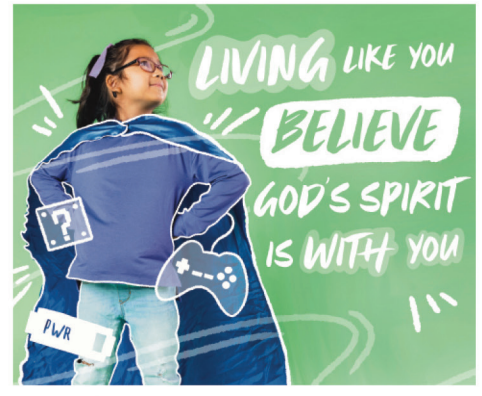
MAY I WHAT JESUS PROMISED THE DISCIPLES