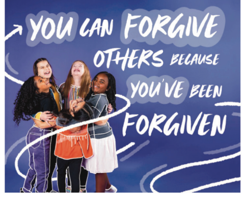
MARCH I WHAT JESUS TAUGHT US ABOUT FORGIVENESS