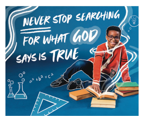
JANUARY I LESSONS FROM THE LIFE OF JESUS ABOUT SCRIPTURE