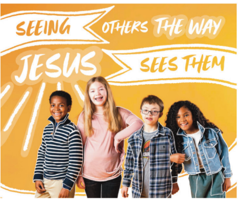
FEBRUARY | WHAT JESUS TAUGHT US ABOUT HOW TO TREAT OTHERS