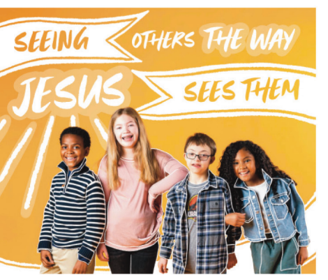
FEBRUARY I WHAT JESUS TAUGHT US ABOUT HOW TO TREAT OTHERS

JANUARY I LESSONS FROM THE LIFE OF JESUS ABOUT SCRIPTURE