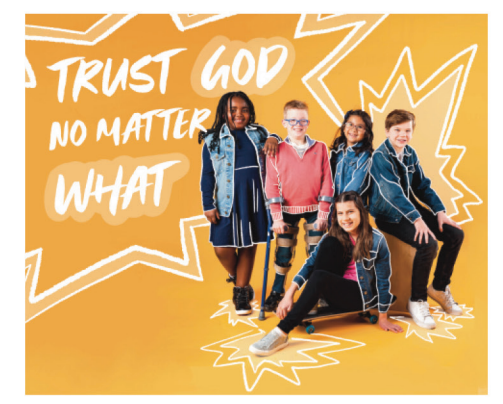
SEPTEMBER I LEARNING ABOUT THE GOD OF ABRAHAM, ISAAC, AND JACOB

AUGUST I WHAT JESUS TAUGHT ABOUT THE GREAT COMMANDMENT