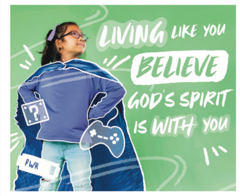
MAY I WHAT JESUS PROMISED THE DISCIPLES

APRIL I WHAT JESUS DID FOR YOU, CHANGES EVERYTHING